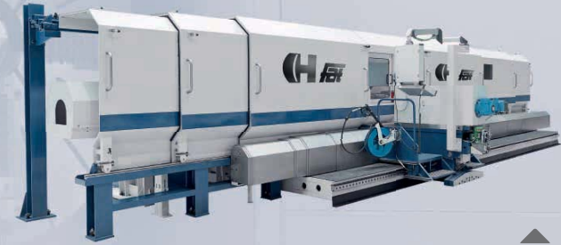
TUR 4MN with full enclosure

The TUR 4MN is a heavy duty 4-guideway lathe designed for highly efficient machining of long and heavy workpieces. This machine can be used for machining of workpieces at length up to 16 m and weight of 80.000 kg.