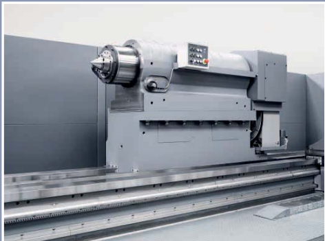
Tailstock with quill's diameter 400 mm and stroke 300 mm.

The enormous wide step bed is made from high-grade cast iron. The upper guide ways are hardened and ground, with high quality steel inserts assembled using "Guide Easy FIX" technology.