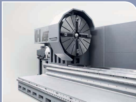
The heavy duty headstock is equipped with 185 mm spindle bore. Thanks to the planetary gearbox, the maximum turning torque is 100.000 Nm.