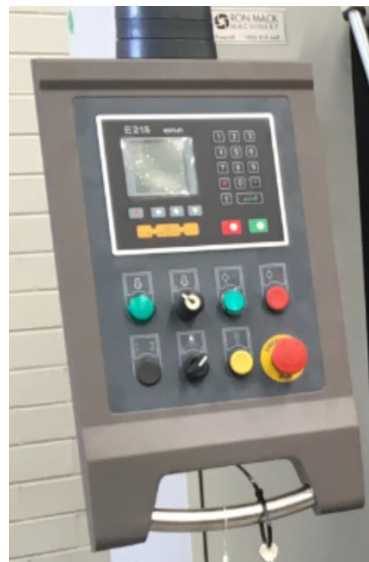
NC control and pendant