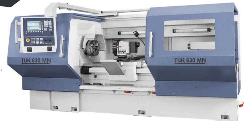
FAT TUR MN 630A x 3000mm Lathe Ø400mm Chuck, 140mm bar capacity, 630mm swing, 3000mm between centres, 8 station auto turret, 2 x D1-11 spindle noses, Siemens 840DSL ShopTurn Control