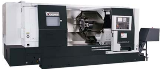
Goodway GS-4000 CNC Turn Centre 15" ~ 20" Chuck, 115 ~ 190mm bar capacity, Ø620mm turning, 750, 1500, 2200 or 3000 mm turn length