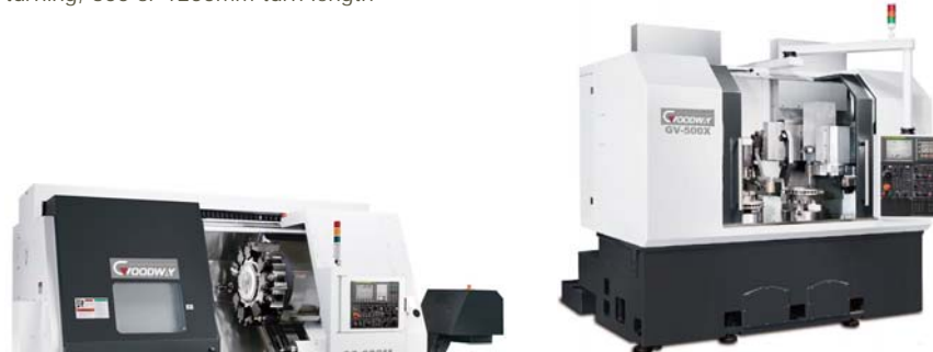
Goodway GV-Series CNC Vertical Lathe 12" ~ 32" Chuck, Ø520 ~ Ø1000 mm turning, 400 ~ 1000mm turn length