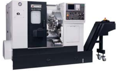
Goodway GLS-1500 CNC Turn Centre 6" or 8" Chuck, 45 or 51mm bar capacity, Ø420mm turning, 330 or 600 mm turn length