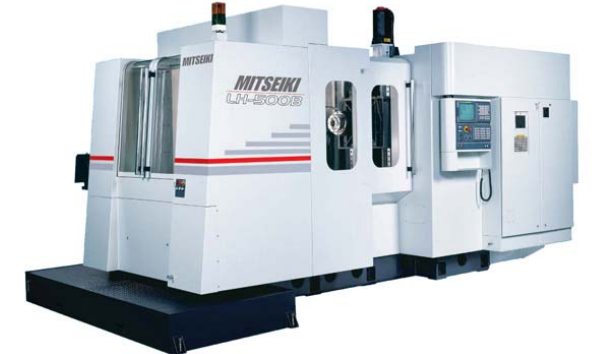
Mitseiki LH-500 Horizontal Machining Centre Travels (X, Y, Z): 700 x 650 x 650mm, 500 x 500mm pallet (x2), 500kg table load, 60 tool ATC, BT40 spindle taper, 10000rpm spindle