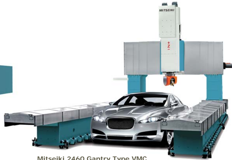
Mitseiki 2460 Gantry Type VMC Travels (X, Y, Z): 6000 x 2400 x 1100mm, 6000 x 1600mm floor plates, 32 tool side mount arm type ATC, BT50 spindle taper, 6000rpm spindle