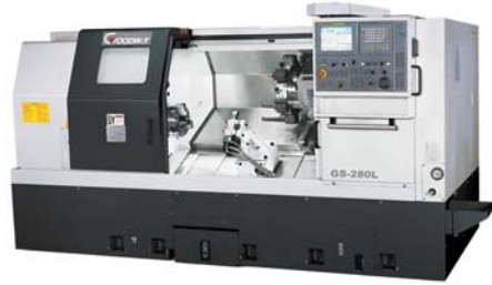
Goodway GS-200 CNC Turn Centre 8" or 10" Chuck, 51 ~ 75mm bar capacity, Ø400mm turning, 600 or 1200mm turn length