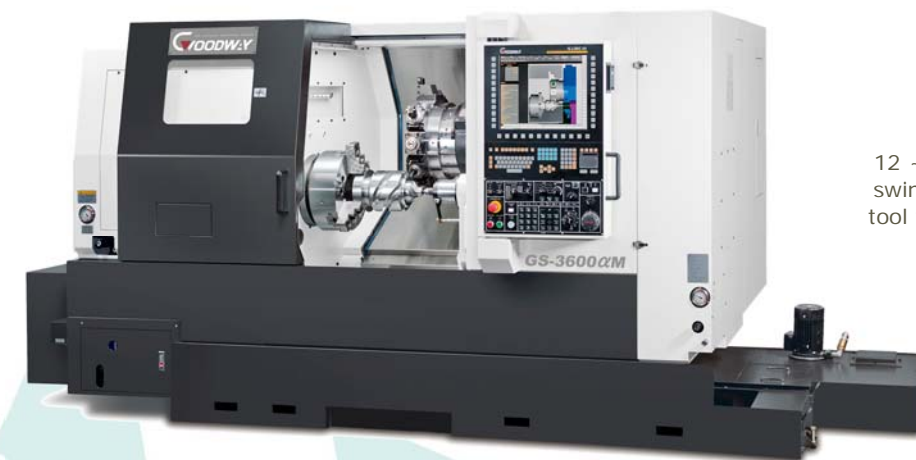
Goodway GS-3000 Turning Centre 12 ~ 15" Chuck, 90 ~ 105mm bar capacity, 630mm swing, 750 & 1500mm turn length, servo 12 position tool turret, 18.5 / 22kw spindle motor, programmable tailstock body, tool setter, chip conveyor. Live Tools, Y Axis & Sub Spindle Available!

Head Office: PO BOX 1084, Osborne Park, Western Australia 6916 Metalwork Showroom: 8 Hector Street, Osborne Park, Western Australia 6017