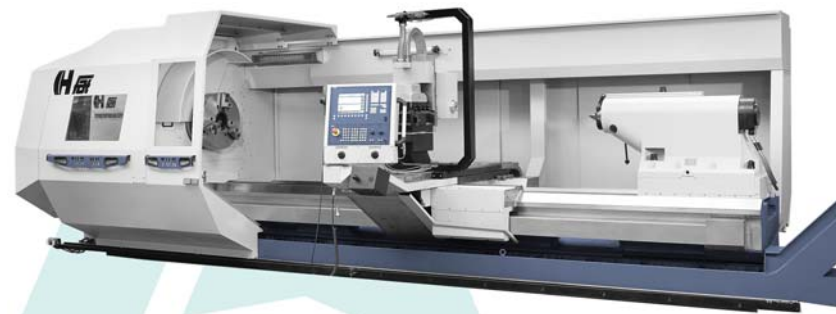
FAT TUR MN 930 x 4000mm CNC Lathe 930mm swing, 4000 mm between centres, 140mm bar capacity, 8 station auto turret