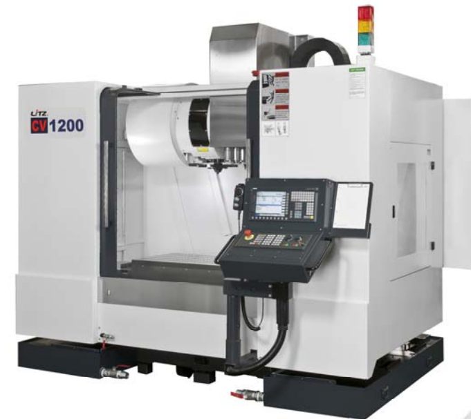
Mitseiki CV-1200A Vert Machining Centre Travels (X, Y, Z): 1200 x 600 x 675mm, 1200 x 560mm table, 1000kg table load, 24 tool arm type ATC, BT40 spindle taper, 8000rpm spindle, CTS preparation 8,000kg heavy duty frame, Fanuc OiMD or 31i or Siemens 828D ShopMill Conversational Control