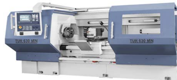
FAT TUR MN 560 x 2000mm CNC Lathe Ø315mm Chuck, 105mm bar capacity, 560mm swing, 2000mm between centres, 8 station auto turret