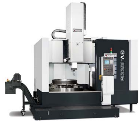
Goodway GV-1200 / 1600 CNC Vertical Lathe 1600 or 2000mm swing, 5000 or 8000kg table load, 1300 mm turn height, auto tool changer