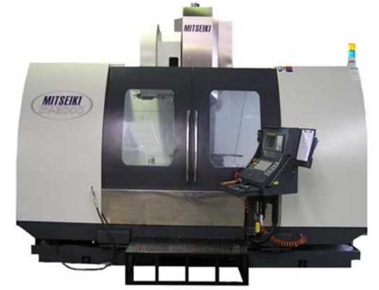
Mitseiki CV-2000B VMC Travels (X, Y, Z): 2000 x 900 x 800mm, 2100 x 850mm table, 3000kg table load, 24 tool arm type ATC, BT50 spindle taper, 6000rpm spindle, CTS preparation, 21000kg heavy duty frame