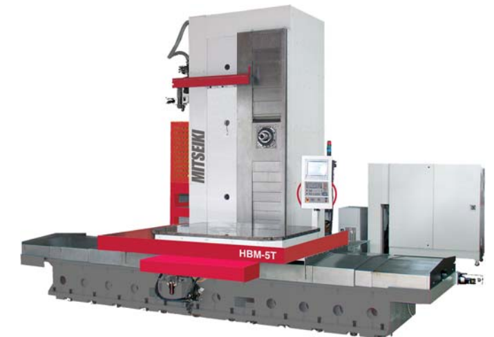
Mitseiki HBM-5T CNC Horizontal Boring Machine Travels (X, Y, Z, W): 3500 ~ 5500 x 2600 x 1400 x 700mm, 1800 x 2200mm table, 15000kg table load, 60 tool ATC (option), BT50 spindle taper, 3000rpm spindle