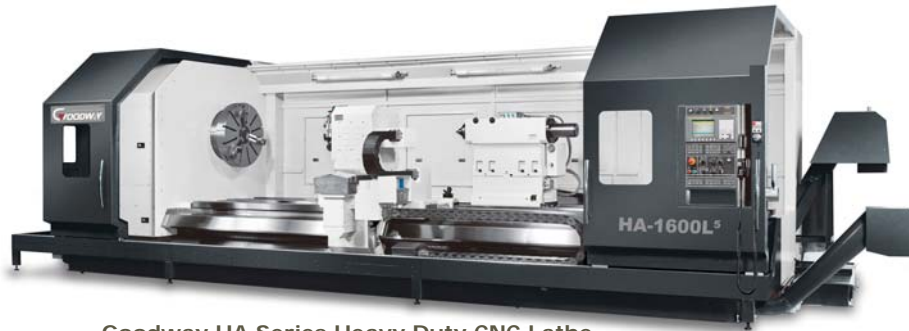
Goodway HA Series Heavy Duty CNC Lathe 1400 ~ 2000mm swing over bed, 2000 ~ 10000mm between centres, up to Ø520mm spindle bore