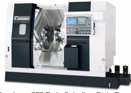
Goodway GTS Twin Spindle - Twin Turret 2 x 10" Chuck, 65mm bar capacity, Ø280mm turning, 200mm turn length