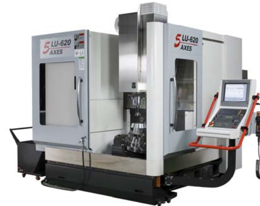
Mitseiki LU-620 5 Axis Machining Centre Travels (X, Y, Z): 620 x 520 x 460mm, Ø500 or Ø650mm table, 300kg table load, 32 tool side mount arm type ATC, NBT40 spindle taper, 12000rpm spindle, 8800kg heavy duty frame