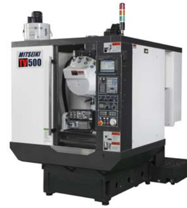
Mitseiki TV Series Drill & Tap Machine Travels (X, Y, Z): 500 x 400 x 330mm, 650 x 400mm table, 250kg table load, 16 tool ATC, BT30 spindle taper, 12000rpm spindle