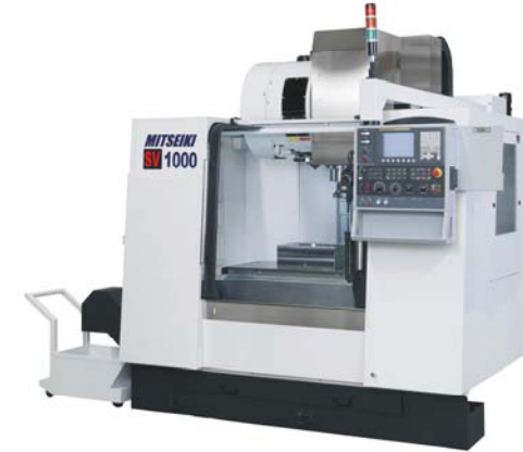
Mitseiki SV-1000A VMC Travels (X, Y, Z): 1000 x 600 x 635mm, 1120 x 560mm table, 1000kg table load, 24 tool arm type ATC, BT40 spindle taper, 8000rpm spindle, CTS preparation, 7000kg heavy duty frame