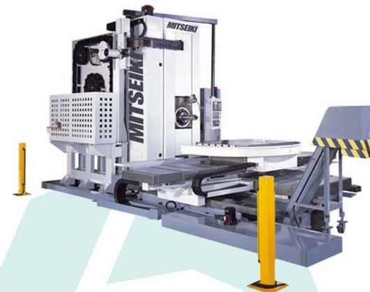
Mitseiki HBM-4 CNC Horizontal Boring Machine Travels (X, Y, Z, W): 2200 x 1600 x 1600 x 550mm, 1200 x 1500mm table, 5000kg table load, 60 tool ATC (option), BT50 spindle taper, 3000rpm spindle